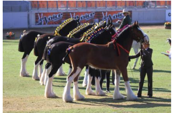
Senior gelding lineup