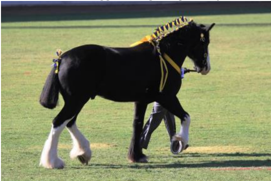
Sugarloaf Maximillion – 4 th gelding under 4