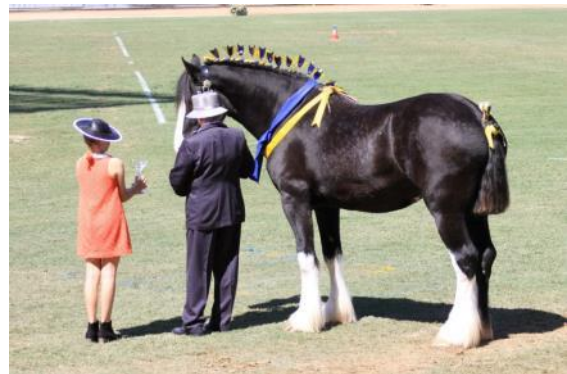
Ingleside Fluor-de-lys – 1 st place filly 2 and under 4 yrs