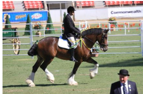
Muwarra Digger – 3 rd Ridden Shire