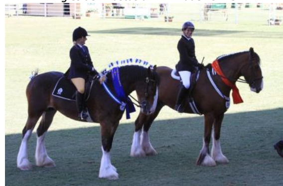
Ridden Shire final lineup