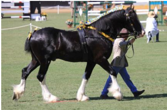
Bickers Court Cavalier – 1st place Shire colt 2 & under 4 and Champion male and Supreme Champion Shire