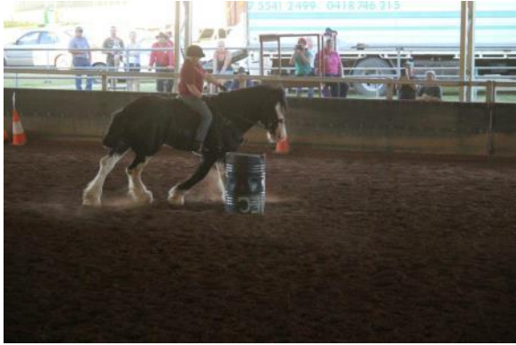
Southern Cross Spitfire – Barrel Racing