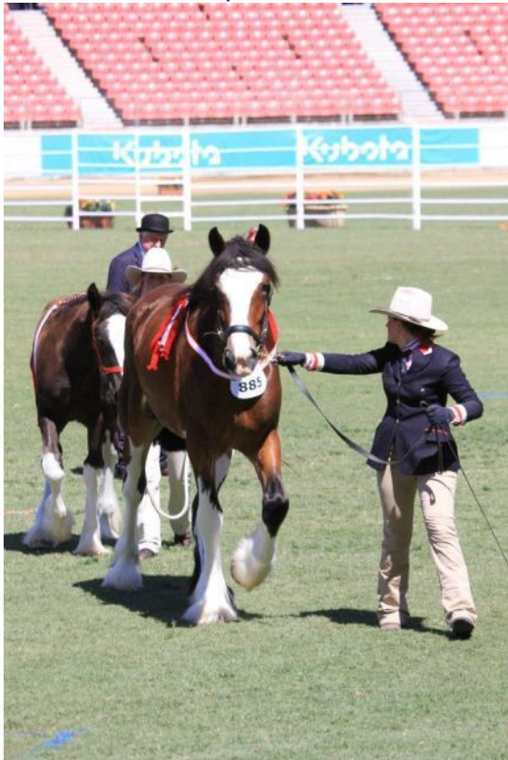
Southern Cross Delta – 5 th place Shire mare over 4yrs