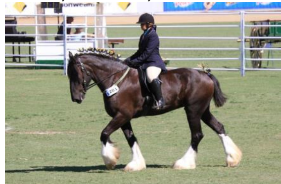
Turnara Lodge Nalla