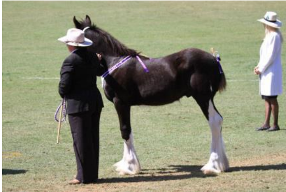
Darkmoor Jester – 2 nd place Shire colt under 2 yrs

For the full gallery, go to the Shire Horse Society Australia facebook page