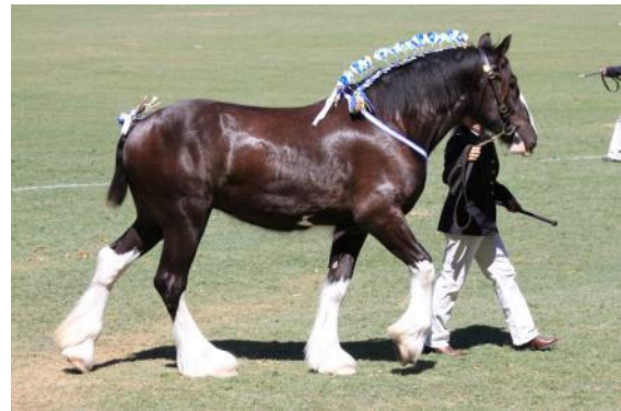
Ingleside Madeline – 1 st place Shire filly under 2yrs and Reserve Champion Female