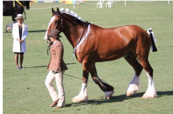
Tullymore Sir Edward – 5 th Gelding over 4yrs