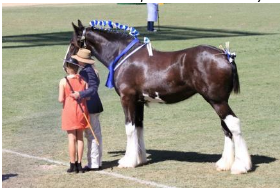
Ingleside Madeline – 1 st place Shire filly under 2 yers and Reserve Champion Female