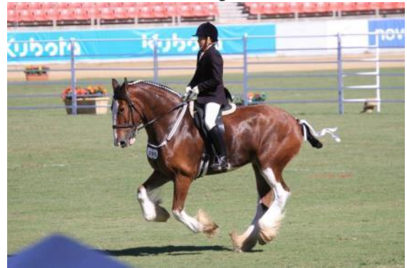
Tullymore Sir Edward – 2 nd Ridden Shire Tullymore Sir Anthony