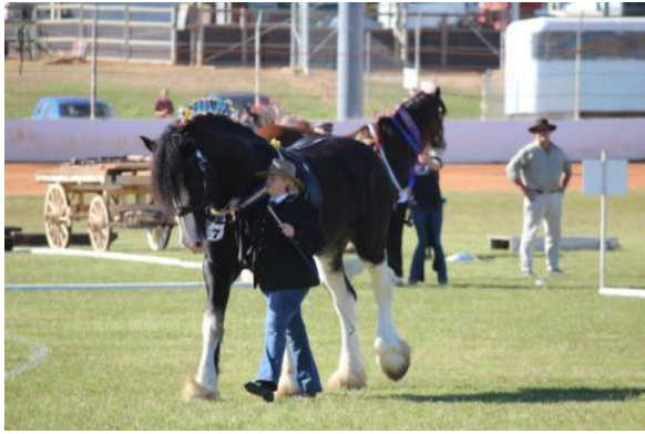
Southern Cross Spitfire