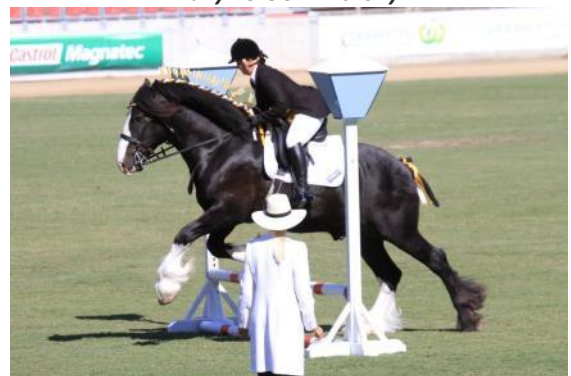
Southern Cross Major – 4 th Ridden Shire