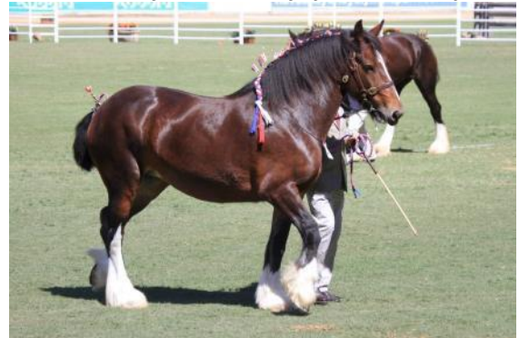
Cedars Lady Aspen – 3 rd Shire mare 4 and over