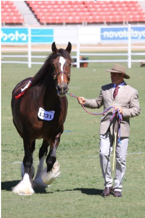
Cedars Lady Aspen – 3 rd Shire mare 4yrs and over