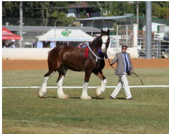
Ingleside Bright Spark