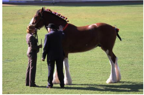
Tullymore Sir William – 1 st Gelding under 4yrs