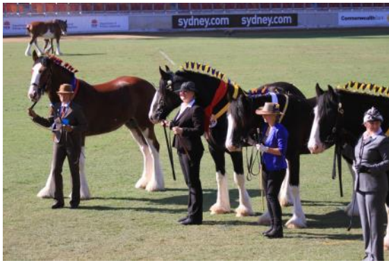
Junior gelding lineup