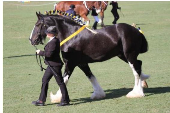
Ingleside Flash Dance – 1 st Gelding over 4yrs