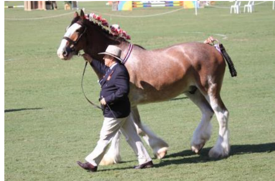
Southern Cross Wesley -