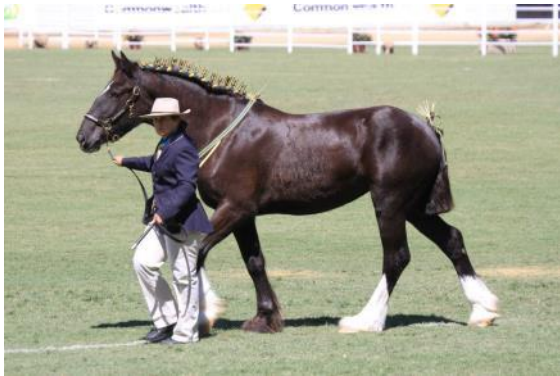
Viewfield Sapphire Flash – 3 rd Shire filly under 2yrs