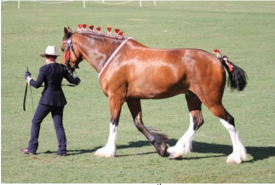
Southern Cross Nikolas – 4 th gelding over 4yrs