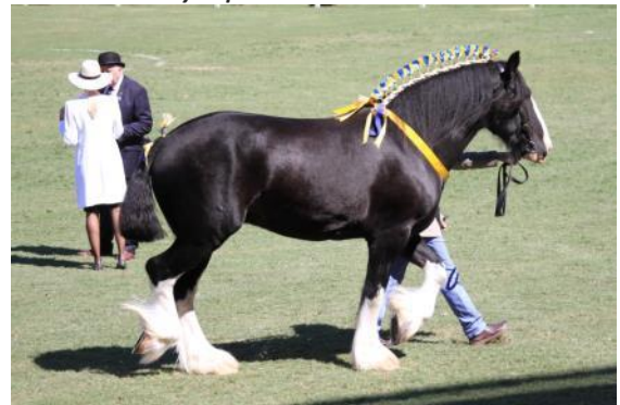
Ingleside Elsa – 1 st place mare 4yrs and over & Champion Female