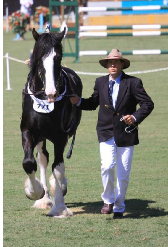
Escrick Extreme – 1st place Shire colt under 2yrs and Reserve Champion male