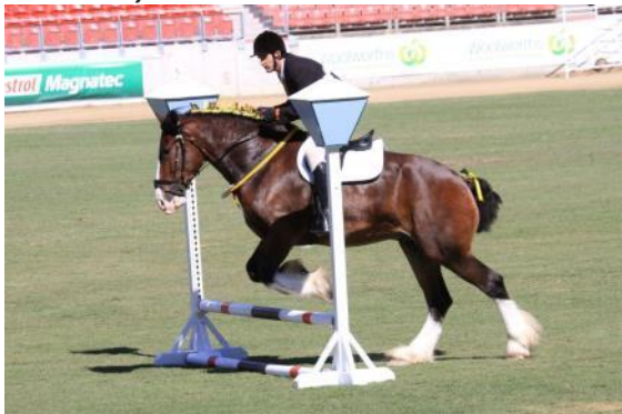
Muwarra Digger – 4 th Ridden Shire