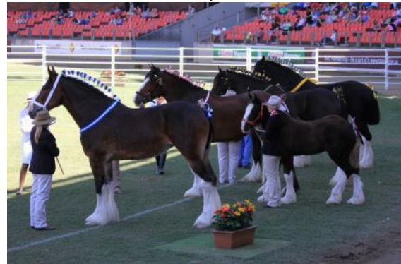
Senior mare lineup