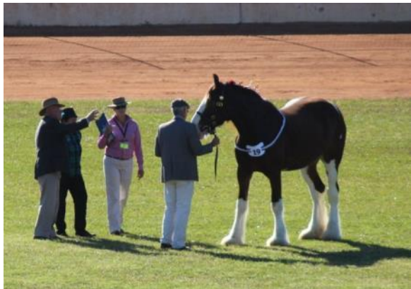
Ingleside Bright Spark