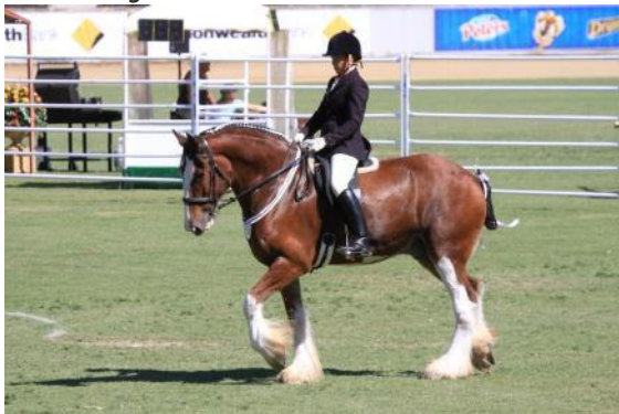
Tullymore Sir Anthony – 5 th Ridden Shire