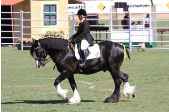
Southern Cross Major – 4 th Ridden Shire