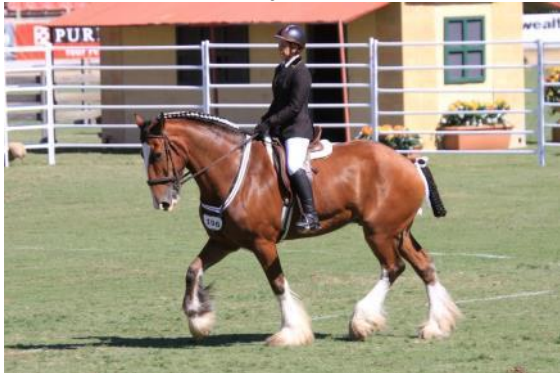
Tullymore Sir Edward – 2 nd Ridden Shire