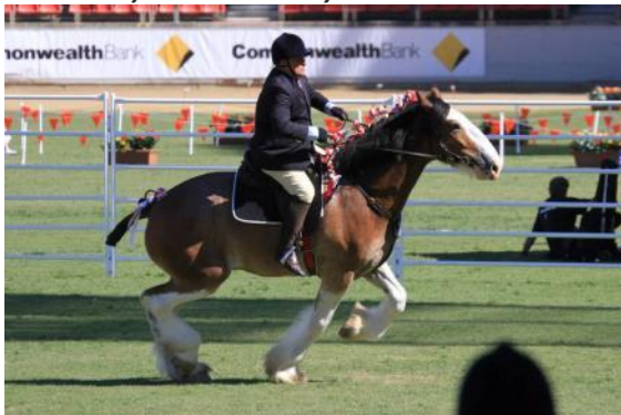
Southern Cross Wesley