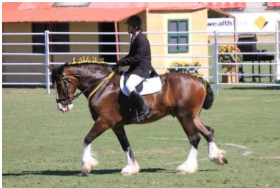
Muwarra Digger – 3 rd Ridden Shire