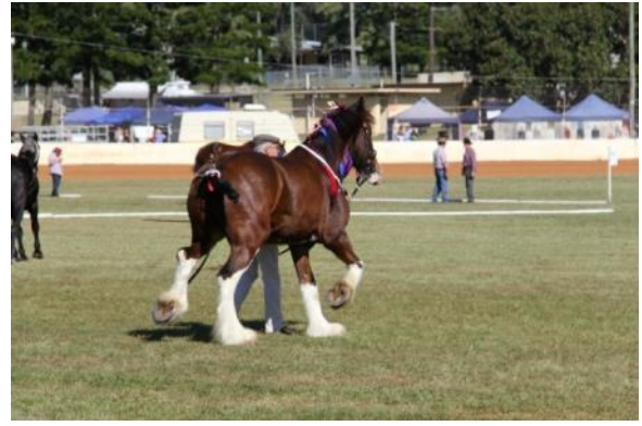
Ingleside Bright Spark