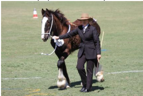
Ingleside Olympia – 2 nd place Shire filly under 2yrs