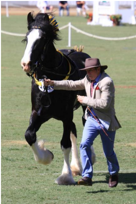
Bickers Court Cavalier – 1st place Shire colt 2 & under 4 and Champion male and Supreme Champion Shire