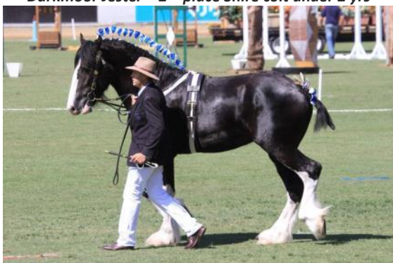
Escrick Extreme – 1 st place Shire colt under 2yrs and Reserve Champion male