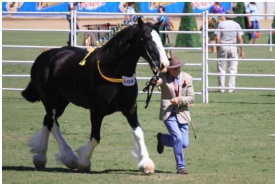
Ingleside Elsa – 1 st place Shire mare 4yrs and over & Champion Female