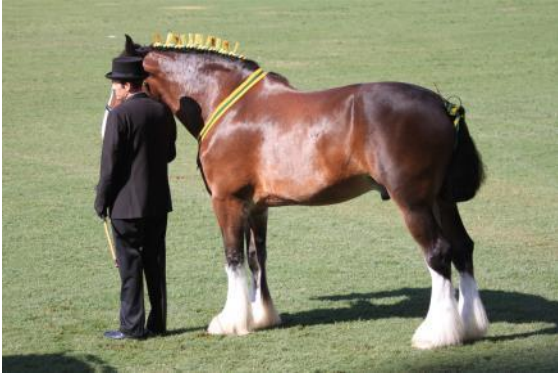
Muwarra Digger – 3 rd gelding over 4yrs