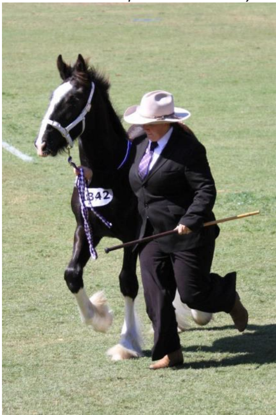
Darkmoor Jester – 2 nd place Shire colt under 2 yrs