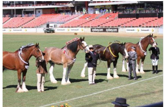
Senior gelding lineup