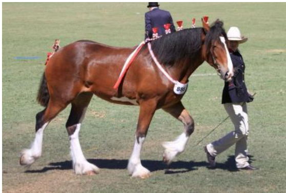
Southern Cross Morning Star'