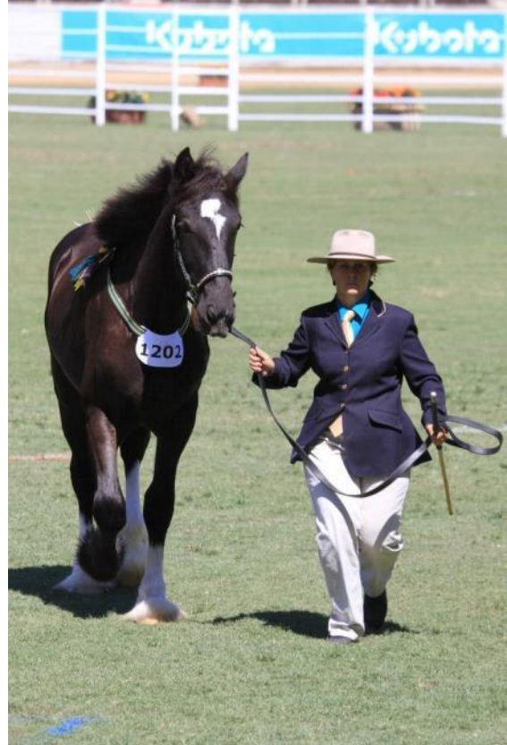
Turnara Lodge Nalla – 4 th place Shire Mare