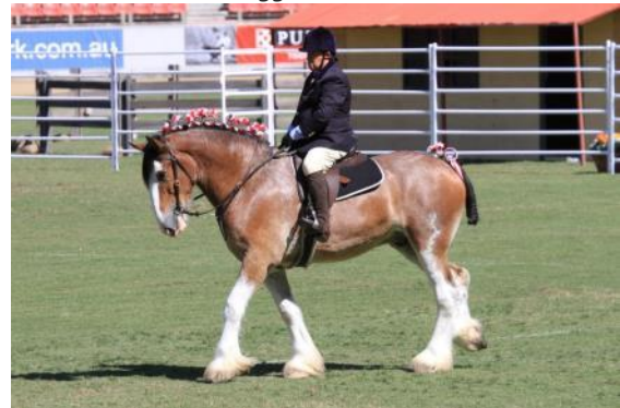
Southern Cross Wesley