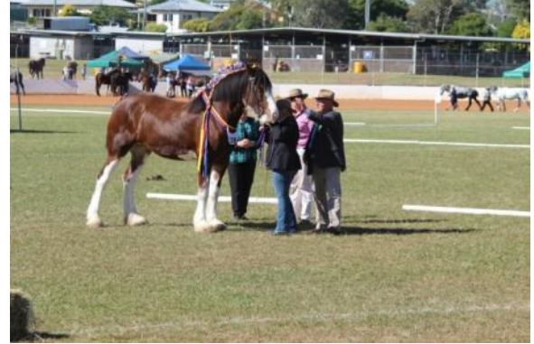
Beandema Daisy Bow