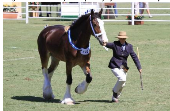
Ingleside Anastasia – 2 nd place Shire mare 4 years and over