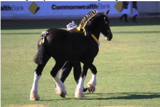
Ingleside Comet – 2 nd gelding under 4yrs