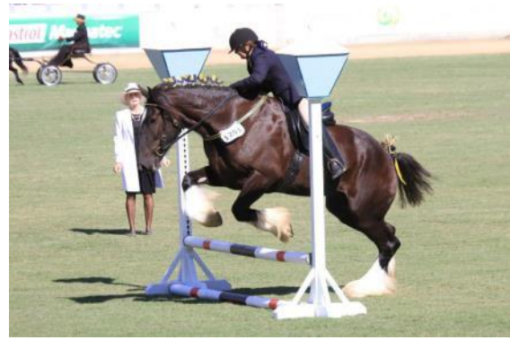
Turnara Lodge Nalla