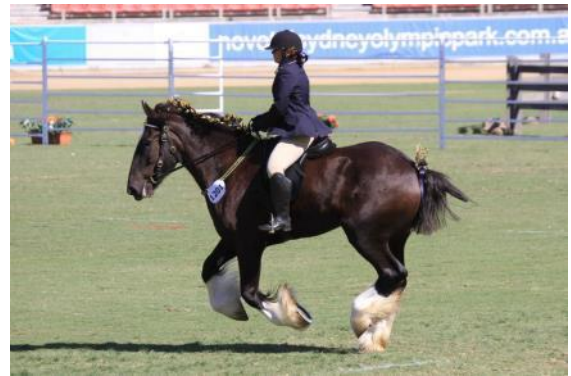
Turnara Lodge Nalla