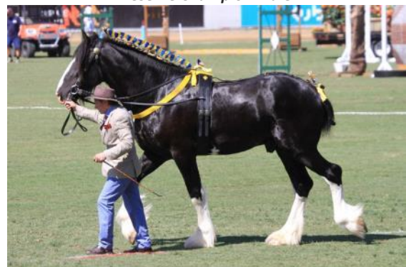
Bickers Court Cavalier – 1st place Shire colt 2 & under 4 and Champion male and Supreme Champion Shire