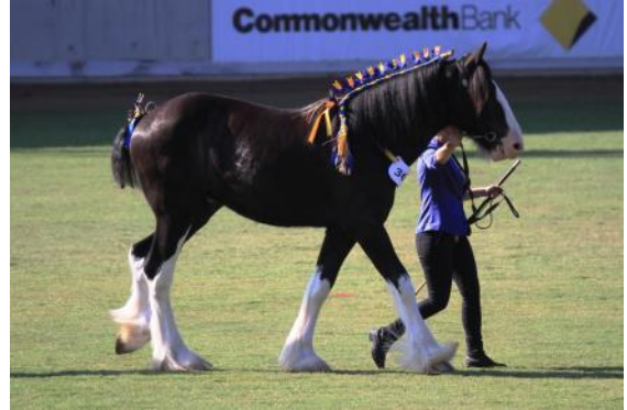
Ingleside Lucky Chance – 3 rd gelding under 4yrs