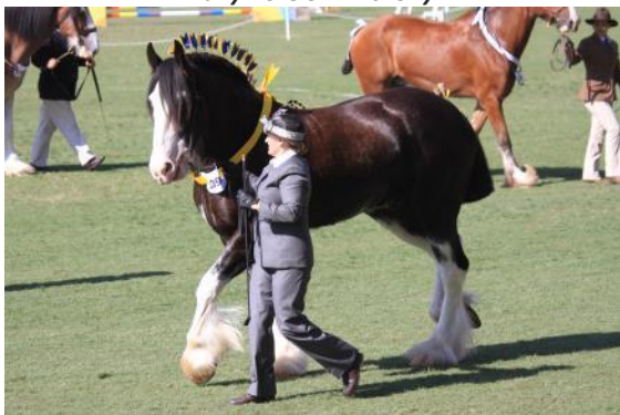
Ingleside Snap Shot