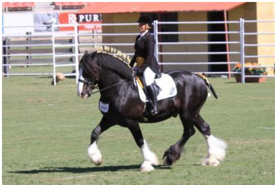
Southern Cross Major – 4 th Ridden Shire