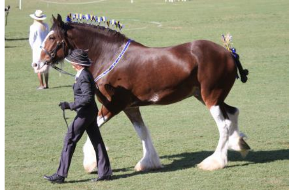
Tullymore Sir Lancelot – 2 nd Gelding over 4yrs