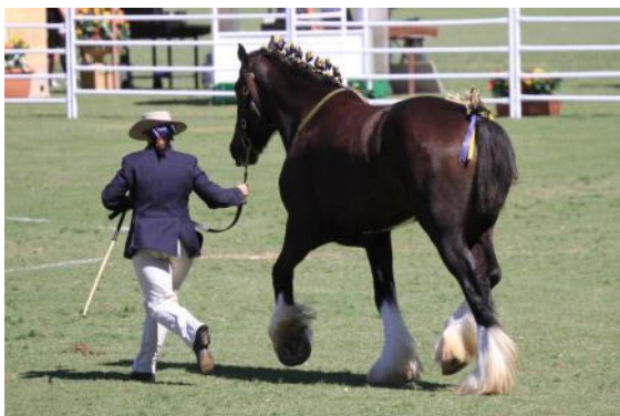
Turnara Lodge Nalla – 4 th place Shire Mare