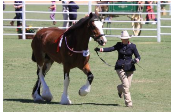
Southern Cross Delta – 5 th place mare 4yrs and over