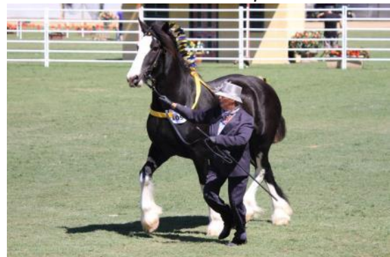
Ingleside Fluer-de-lys – 1 st place filly 2 and under 4 yrs